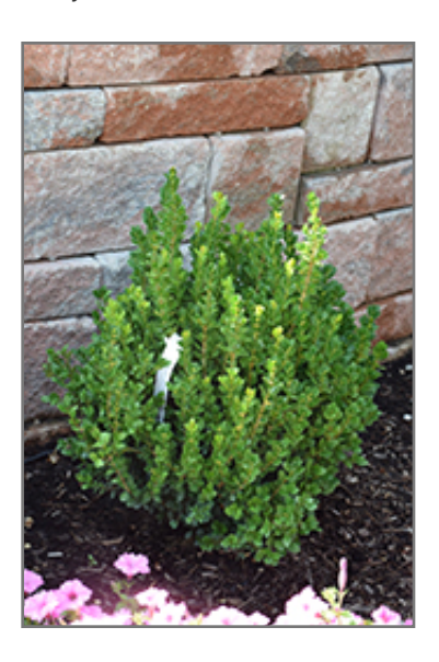
NewGen Freedom Boxwood

NewGen Freedom Boxwood is recommended for the following landscape applications;