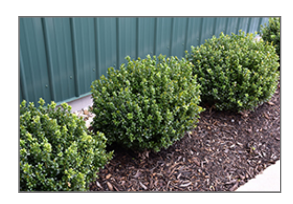
NewGen Freedom Boxwood

This is a relatively low maintenance shrub, and is best pruned in late winter once the threat of extreme cold has passed. Deer don't particularly care for this plant and will usually leave it alone in favor of tastier treats. It has no significant negative characteristics.