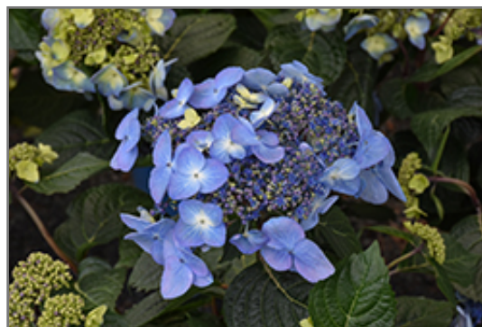
Endless Summer Pop Star Hydrangea flowers