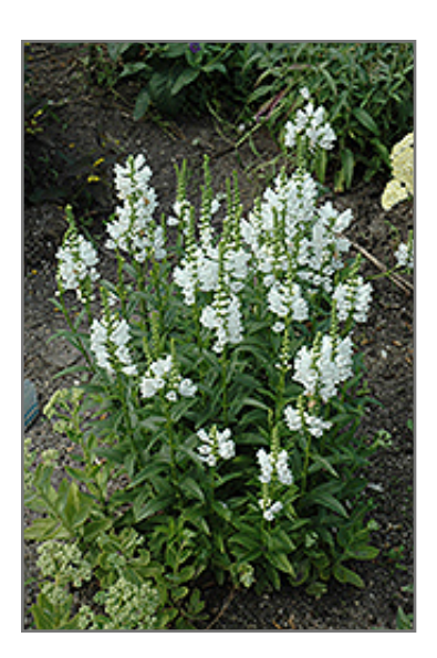
Miss Manners Obedient Plant in bloom