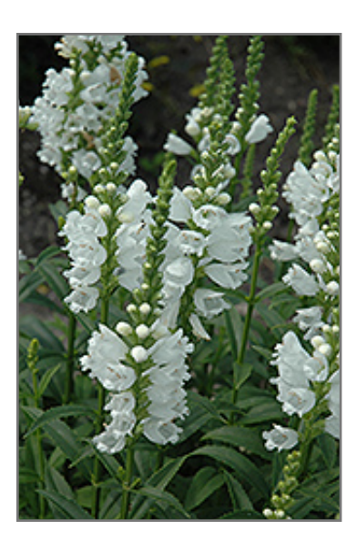
Miss Manners Obedient Plant flowers