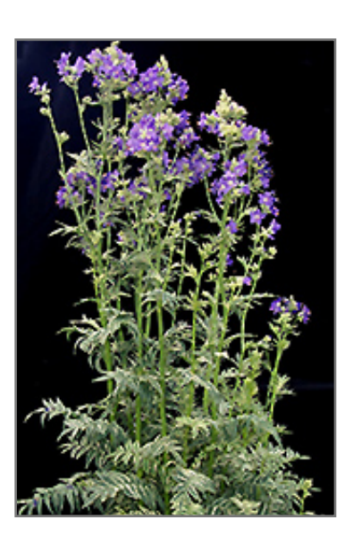
Snow And Sapphires Jacob's Ladder in bloom

Snow And Sapphires Jacob's Ladder has masses of beautiful spikes of lightly-scented sky blue flowers rising above the foliage from mid spring to mid summer, which are most effective when planted in groupings. The flowers are excellent for cutting. Its attractive ferny pinnately compound leaves remain green in color with showy white variegation throughout the season.