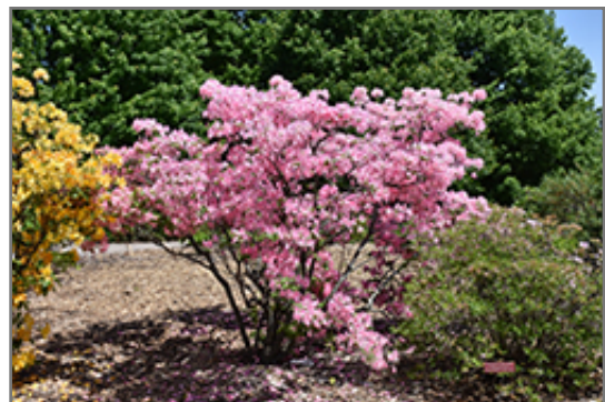
Northern Lights Azalea in bloom