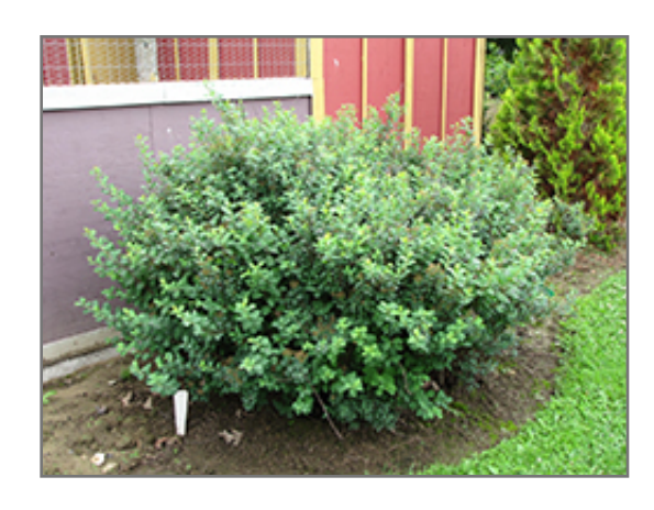
Tor Spirea

This shrub should only be grown in full sunlight. It prefers to grow in average to moist conditions, and shouldn't be allowed to dry out. It is not particular as to soil type or pH. It is highly tolerant of urban pollution and will even thrive in inner city environments. This is a selected variety of a species not originally from North America.