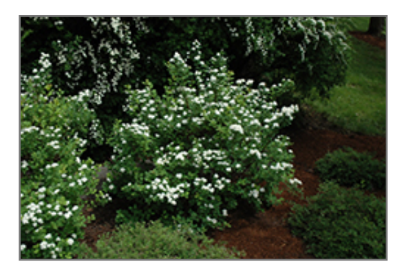
Tor Spirea in bloom