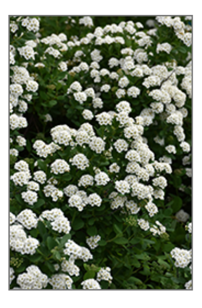
Tor Spirea flowers

Tor Spirea is recommended for the following landscape applications;