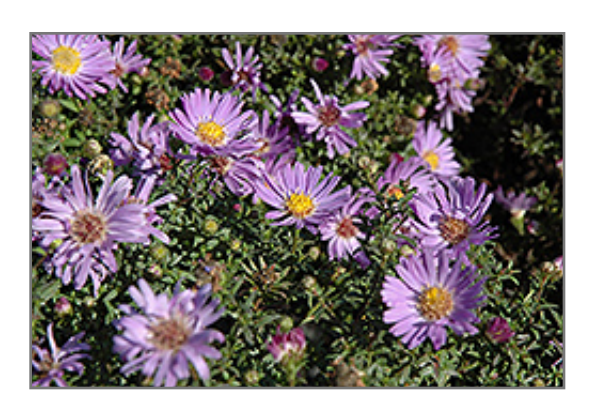
Woods Light Blue Aster flowers

Compact, mounding habit; profusion of powder blue flowers and attractive lance-like green leaves; prefers cool, moist soil; water the root zone instead of from the top to reduce fungal disease; water regularly to encourgage more blooms