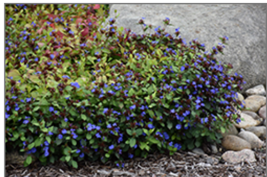
Plumbago in bloom