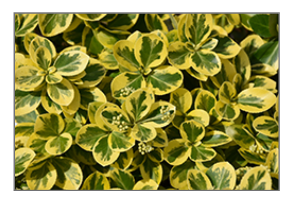
Gold Splash Wintercreeper flower buds

This shrub performs well in both full sun and full shade. It is very adaptable to both dry and moist locations, and should do just fine under typical garden conditions. It is not particular as to soil type or pH. It is highly tolerant of urban pollution and will even thrive in inner city environments, and will benefit from being planted in a relatively sheltered location. This is a selected variety of a species not originally from North America.