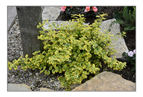
Gold Splash Wintercreeper