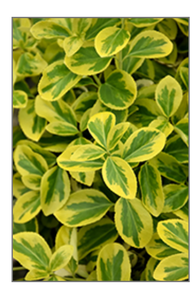
Gold Splash Wintercreeper foliage

Gold Splash Wintercreeper is recommended for the following landscape applications;