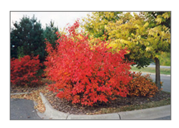
Red Chokeberry in fall

Red Chokeberry is recommended for the following landscape applications;