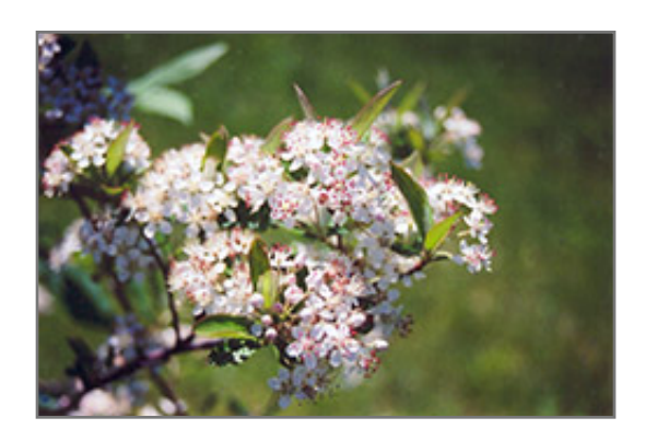
Red Chokeberry flowers