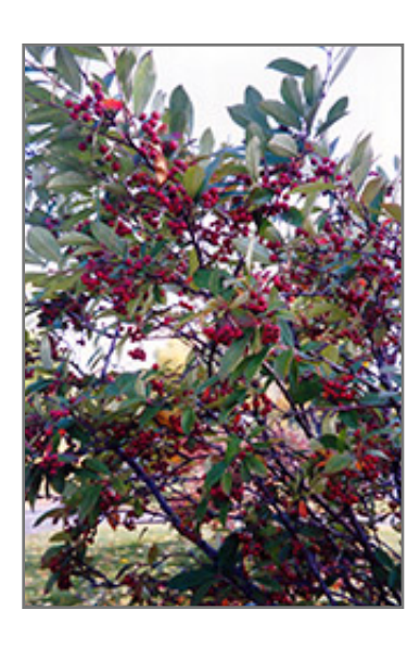
Red Chokeberry fruit

This shrub should only be grown in full sunlight. It is an amazingly adaptable plant, tolerating both dry conditions and even some standing water. It is not particular as to soil type or pH, and is able to handle environmental salt. It is somewhat tolerant of urban pollution. This species is native to parts of North America.