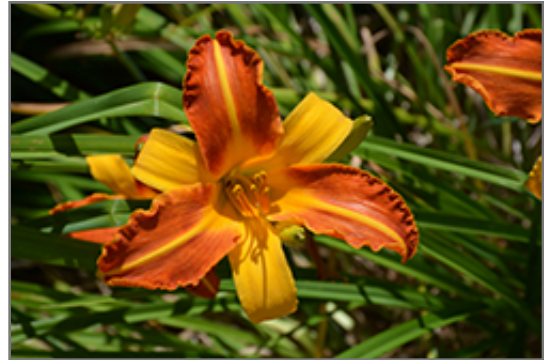
Frans Hals Daylily flowers

Outstanding, super-bright, large, bicolor trumpets alternating in red-orange and gold; sturdy, strong, easy to care for, great grassy texture and form; good for the beginner gardener and the pro