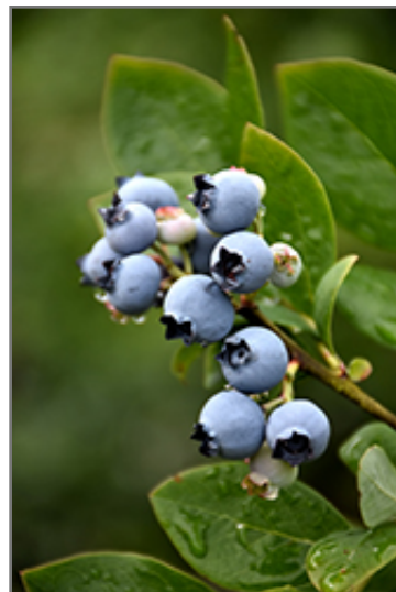
Northblue Blueberry fruit

This is a multi-stemmed deciduous shrub with an upright spreading habit of growth. Its relatively fine texture sets it apart from other landscape plants with less refined foliage. This is a relatively low maintenance plant, and usually looks its best without pruning, although it will tolerate pruning. It is a good choice for attracting birds to your yard. It has no significant negative characteristics.