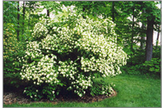
Arrowwood in bloom

This shrub does best in full sun to partial shade. It prefers to grow in average to moist conditions, and shouldn't be allowed to dry out. It is not particular as to soil type or pH. It is highly tolerant of urban pollution and will even thrive in inner city environments. This species is native to parts of North America.