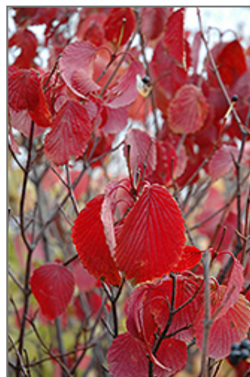
Arrowwood in fall