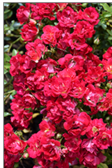
Red Drift Rose flowers

Red Drift Rose is recommended for the following landscape applications;