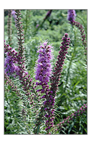
Prairie Blazing Star flowers

An upright clump-forming plant that towers to the sky with its tall flower spikes; visually spectacular when massed together along a border or as a garden accent; easily grown, hardy and disease resistant