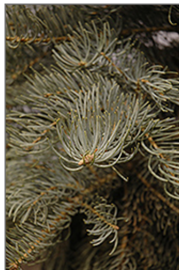
Blue Select White Fir foliage

Blue Select White Fir will grow to be about 45 feet tall at maturity, with a spread of 20 feet. It has a low canopy, and should not be planted underneath power lines. It grows at a slow rate, and under ideal conditions can be expected to live for 60 years or more.