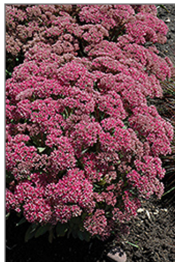
Mr. Goodbud Stonecrop flowers

Mr. Goodbud Stonecrop is recommended for the following landscape applications;