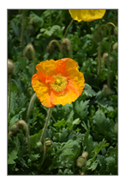
Champagne Bubbles Poppy flowers

This plant will require occasional maintenance and upkeep, and should only be pruned after flowering to avoid removing any of the current season's flowers. Deer don't particularly care for this plant and will usually leave it alone in favor of tastier treats. Gardeners should be aware of the following characteristic(s) that may warrant special consideration;