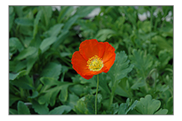
Champagne Bubbles Poppy flowers