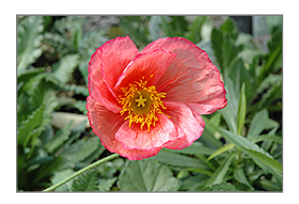
Champagne Bubbles Poppy flowers

Champagne Bubbles Poppy will grow to be only 6 inches tall at maturity extending to 18 inches tall with the flowers, with a spread of 18 inches. When grown in masses or used as a bedding plant, individual plants should be spaced approximately 14 inches apart. It grows at a fast rate, and under ideal conditions can be expected to live for approximately 3 years. As an herbaceous perennial, this plant will usually die back to the crown each winter, and will regrow from the base each spring. Be careful not to disturb the crown in late winter when it may not be readily seen! As this plant tends to go dormant in summer, it is best interplanted with late-season bloomers to hide the dying foliage.