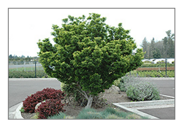
Lions Head Japanese Maple