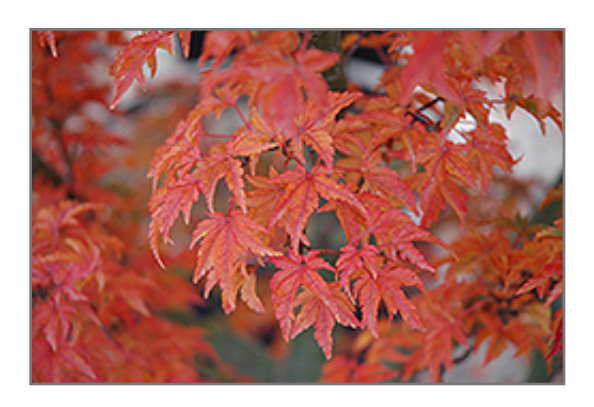
Lions Head Japanese Maple in fall

Lions Head Japanese Maple will grow to be about 20 feet tall at maturity, with a spread of 15 feet. It has a low canopy with a typical clearance of 1 foot from the ground, and is suitable for planting under power lines. It grows at a slow rate, and under ideal conditions can be expected to live for 80 years or more.