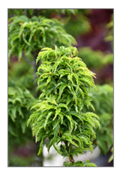
Lions Head Japanese Maple foliage

This is a relatively low maintenance tree, and should only be pruned in summer after the leaves have fully developed, as it may 'bleed' sap if pruned in late winter or early spring. It has no significant negative characteristics.