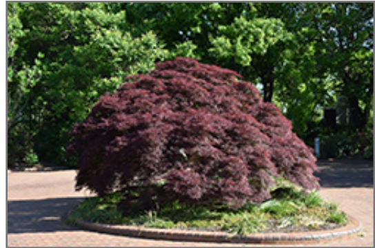
Purple-Leaf Threadleaf Japanese Maple

Purple-Leaf Threadleaf Japanese Maple is recommended for the following landscape applications;