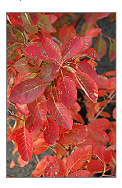
Autumn Brilliance Serviceberry in fall