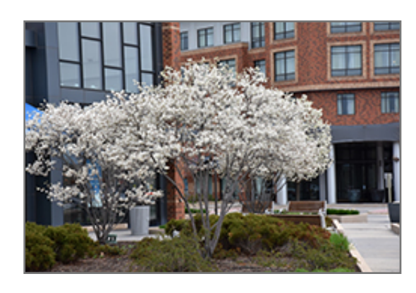
Autumn Brilliance Serviceberry in bloom

Autumn Brilliance Serviceberry is recommended for the following landscape applications;