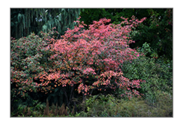
Autumn Brilliance Serviceberry in fall

This tree does best in full sun to partial shade. It prefers to grow in average to moist conditions, and shouldn't be allowed to dry out. It is not particular as to soil type or pH. It is somewhat tolerant of urban pollution. This particular variety is an interspecific hybrid.