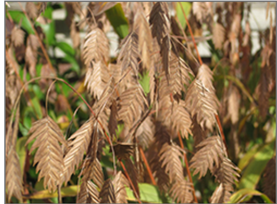
Northern Sea Oats fruit

Northern Sea Oats will grow to be about 4 feet tall at maturity, with a spread of 30 inches. Its foliage tends to remain dense right to the ground, not requiring facer plants in front. It grows at a medium rate, and under ideal conditions can be expected to live for approximately 10 years. As an herbaceous perennial, this plant will usually die back to the crown each winter, and will regrow from the base each spring. Be careful not to disturb the crown in late winter when it may not be readily seen!