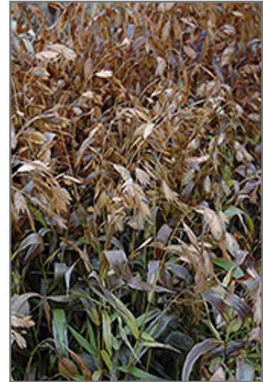
Northern Sea Oats in fall

Northern Sea Oats is recommended for the following landscape applications;