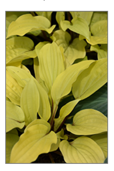
Fire Island Hosta foliage