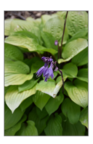
Fire Island Hosta flowers