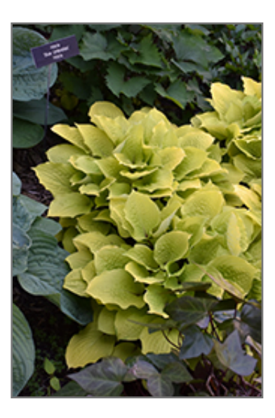
Fire Island Hosta

Fire Island Hosta is recommended for the following landscape applications;