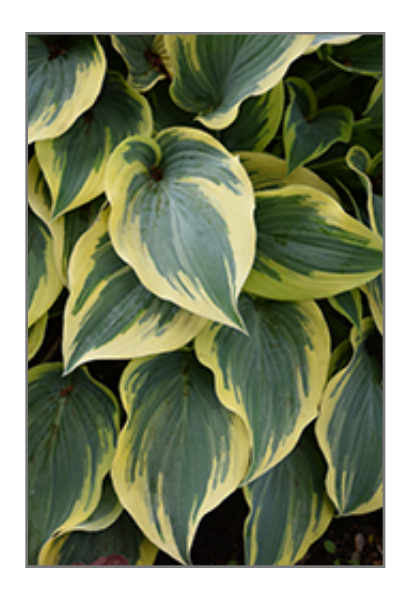
First Frost Hosta foliage