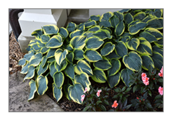
First Frost Hosta

First Frost Hosta will grow to be about 10 inches tall at maturity extending to 18 inches tall with the flowers, with a spread of 3 feet. When grown in masses or used as a bedding plant, individual plants should be spaced approximately 30 inches apart. Its foliage tends to remain low and dense right to the ground. It grows at a medium rate, and under ideal conditions can be expected to live for approximately 10 years. As an herbaceous perennial, this plant will usually die back to the crown each winter, and will regrow from the base each spring. Be careful not to disturb the crown in late winter when it may not be readily seen!