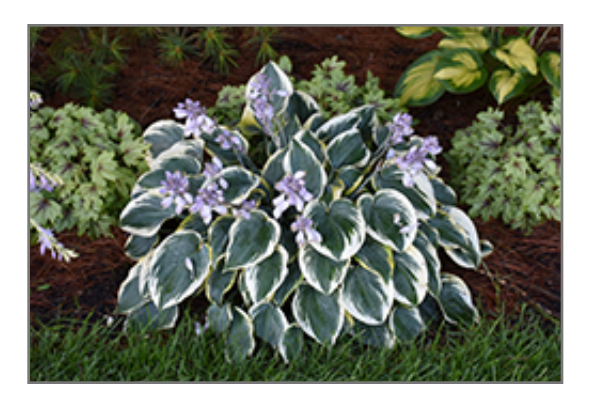
First Frost Hosta in bloom