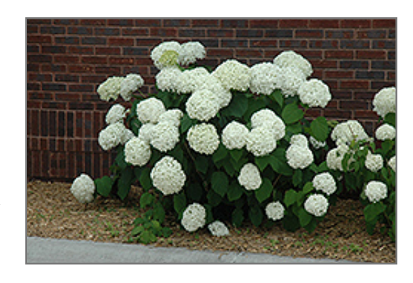
Incrediball Hydrangea in bloom

This shrub does best in full sun to partial shade. You may want to keep it away from hot, dry locations that receive direct afternoon sun or which get reflected sunlight, such as against the south side of a white wall. It prefers to grow in average to moist conditions, and shouldn't be allowed to dry out. It is not particular as to soil type or pH. It is highly tolerant of urban pollution and will even thrive in inner city environments. Consider applying a thick mulch around the root zone in winter to protect it in exposed locations or colder microclimates. This is a selection of a native North American species.