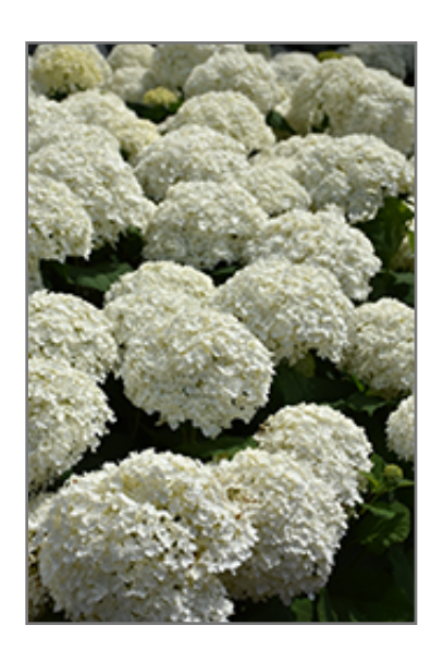
Incrediball Hydrangea flowers