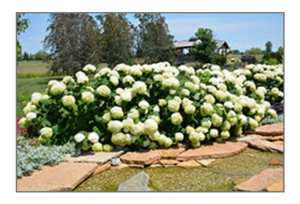
Incrediball Hydrangea in bloom