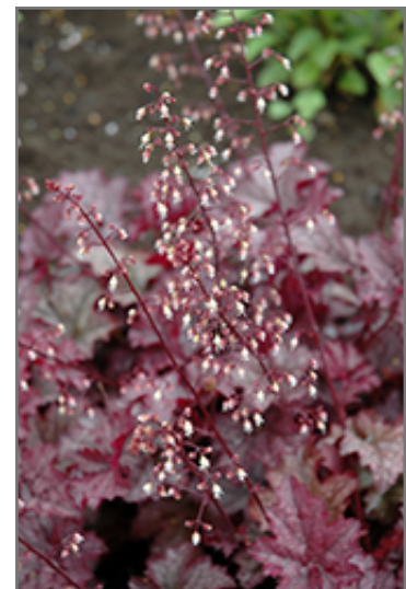
Amethyst Mist Coral Bells flowers