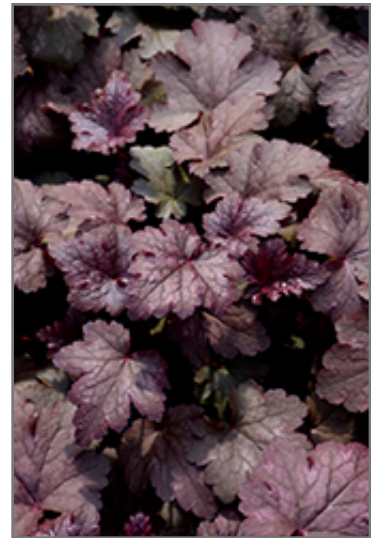
Amethyst Mist Coral Bells foliage

Amethyst Mist Coral Bells is recommended for the following landscape applications;