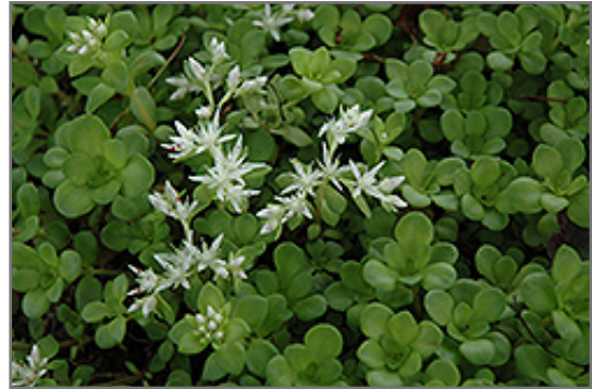
Woodland Stonecrop flowers

This mat forming native sedum is unlike most of its cousins in that it prefers partially shaded conditions and moist soil; starry white blooms are revealed throughout spring; evergreen leaves are shiny and succulent, creating a lush woodland groundcover