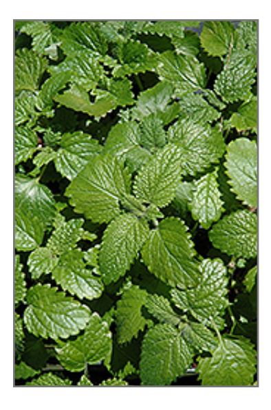
Lemon Balm foliage

Lemon Balm's attractive fragrant pointy leaves emerge light green in spring, turning green in color throughout the season on a plant with an upright spreading habit of growth. It features dainty lightly-scented white flowers along the stems in late summer.