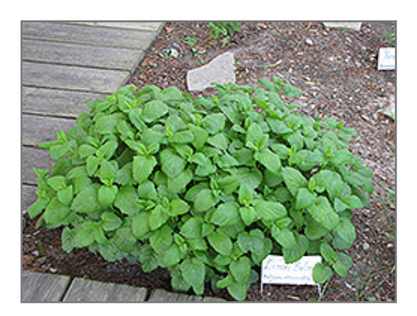
Lemon Balm