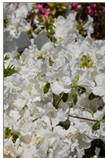
Girard's Pleasant White Azalea flowers

Girard's Pleasant White Azalea will grow to be about 4 feet tall at maturity, with a spread of 5 feet. It tends to be a little leggy, with a typical clearance of 1 foot from the ground. It grows at a slow rate, and under ideal conditions can be expected to live for 40 years or more.