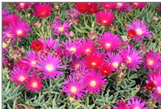
Purple Ice Plant flowers