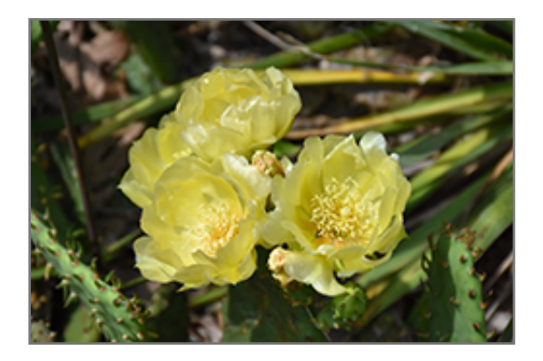
Prickly Pear Cactus flowers