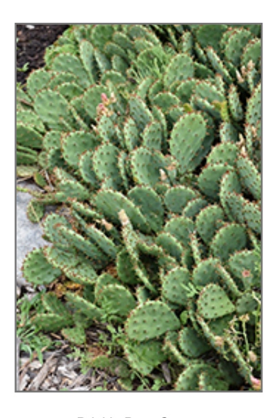
Prickly Pear Cactus

Prickly Pear Cactus is a small succulent evergreen plant with a spreading habit of growth that trails along the ground. As a type of cactus, it has no true foliage; the body of the plant is wholly comprised of a linked series of spiny light green pads which are connected together to form the branches of the plant.